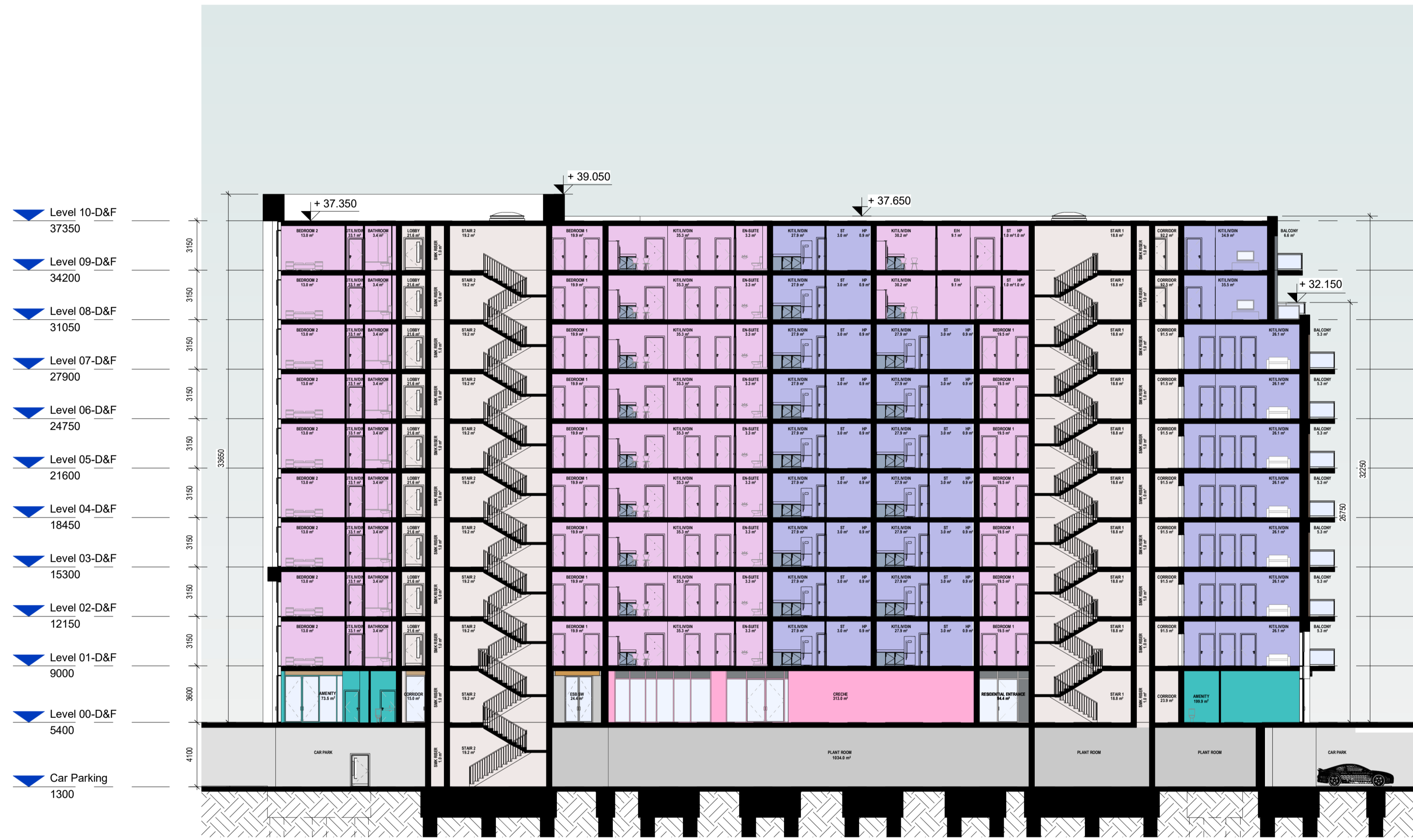
1 BLOCK D-SECTION C-C 1 : 200